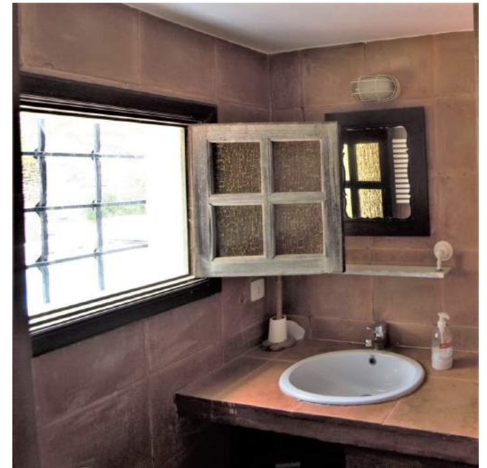
Library, bathrooms and hall