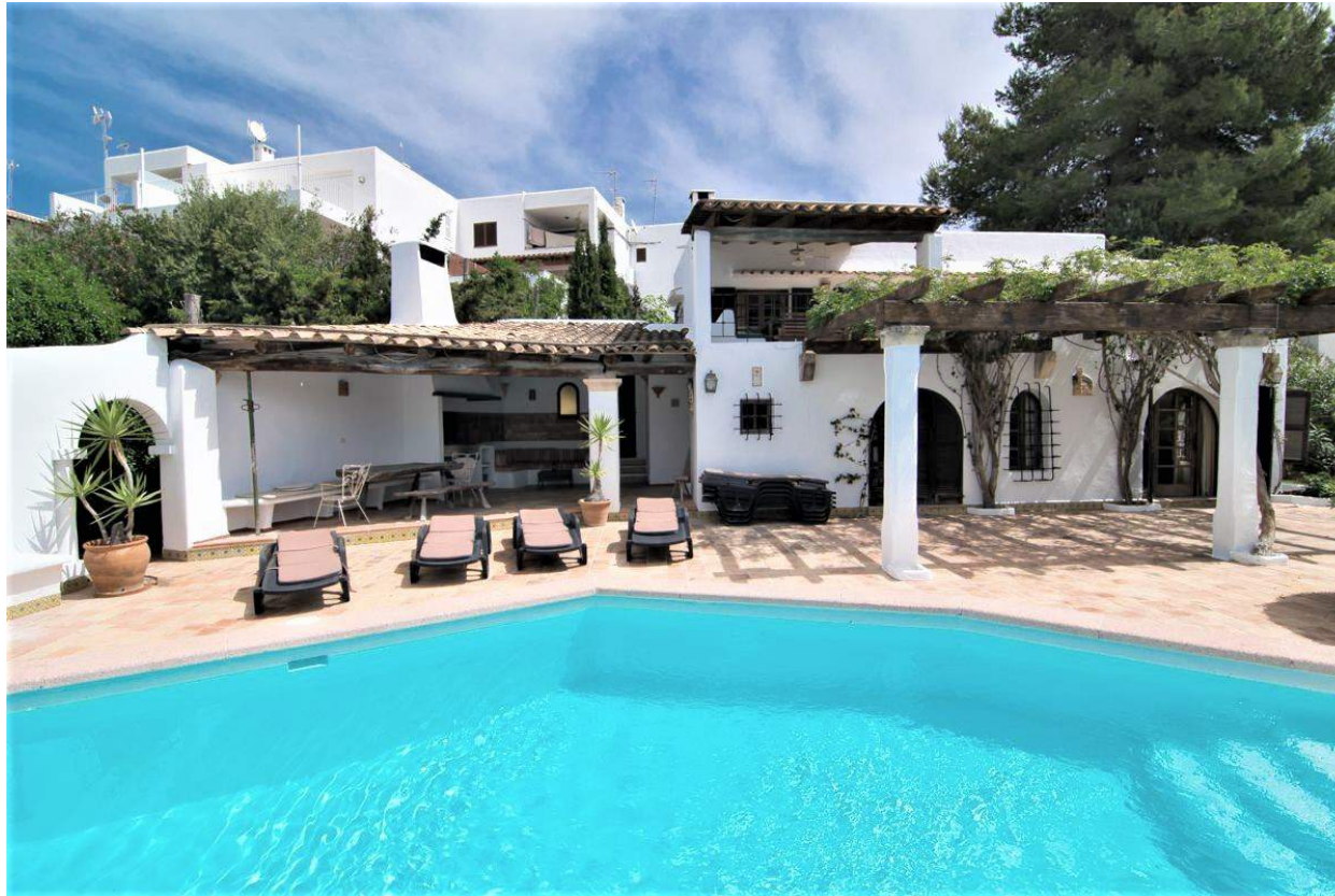
• CASA PESCADOR • Cala d'Or