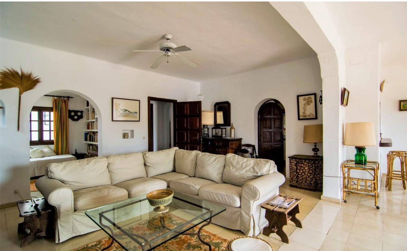
The library with office is directly connected to the living room