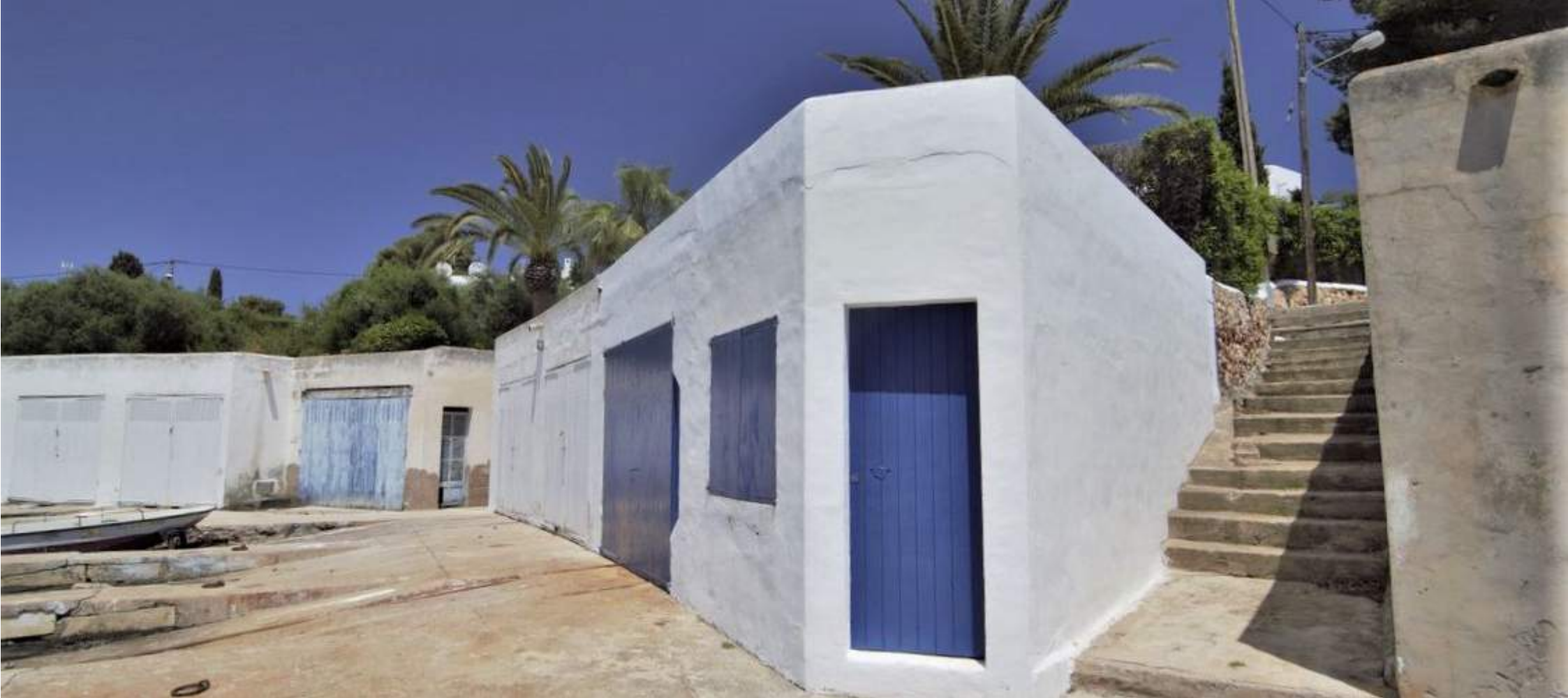
The property is srrounded by charming features